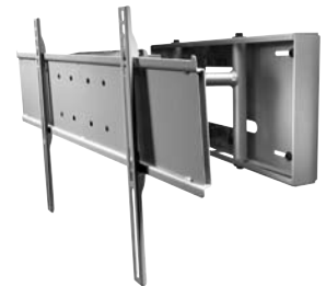
Universal model includes universal adapter plate