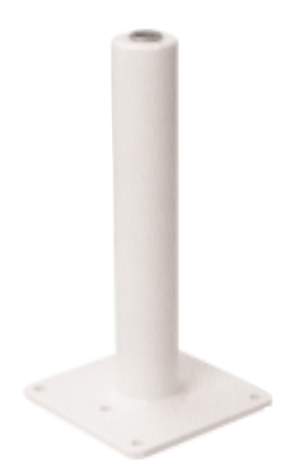
PDi-STM-A single table mount 12" in height

Single table mount. Designed for mounting to a counter top surface and supporting PDi support arms (model 400 or 500). Mounting plate is heavy duty 1/4" thick steel plate, and drilled for "F" feed thru barrel connector (supplied). Extra tall 12" tube height allows television to rotate and clear counter top surface. Permanently lubricated oillite pivot bushing. Standard bushing size in 5/8", 1/2" is available on request. Optional rotational stop kits are available to limit rotation and prevent interference.